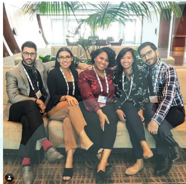
NUSNA students at the California Student Nurses' Association Conference (Bonus: our team won a bunch of awards!)

Note: One member should be designated as the finance person who will be responsible for your club's funds. Another person will be the Interclub Council Rep. (That's the person who goes to monthly club meetings with reps from all clubs.)